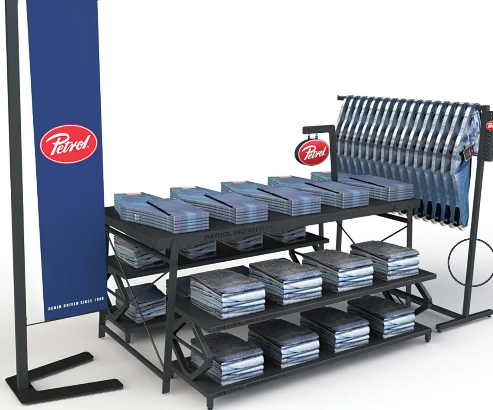
Rack unit Hanging rack