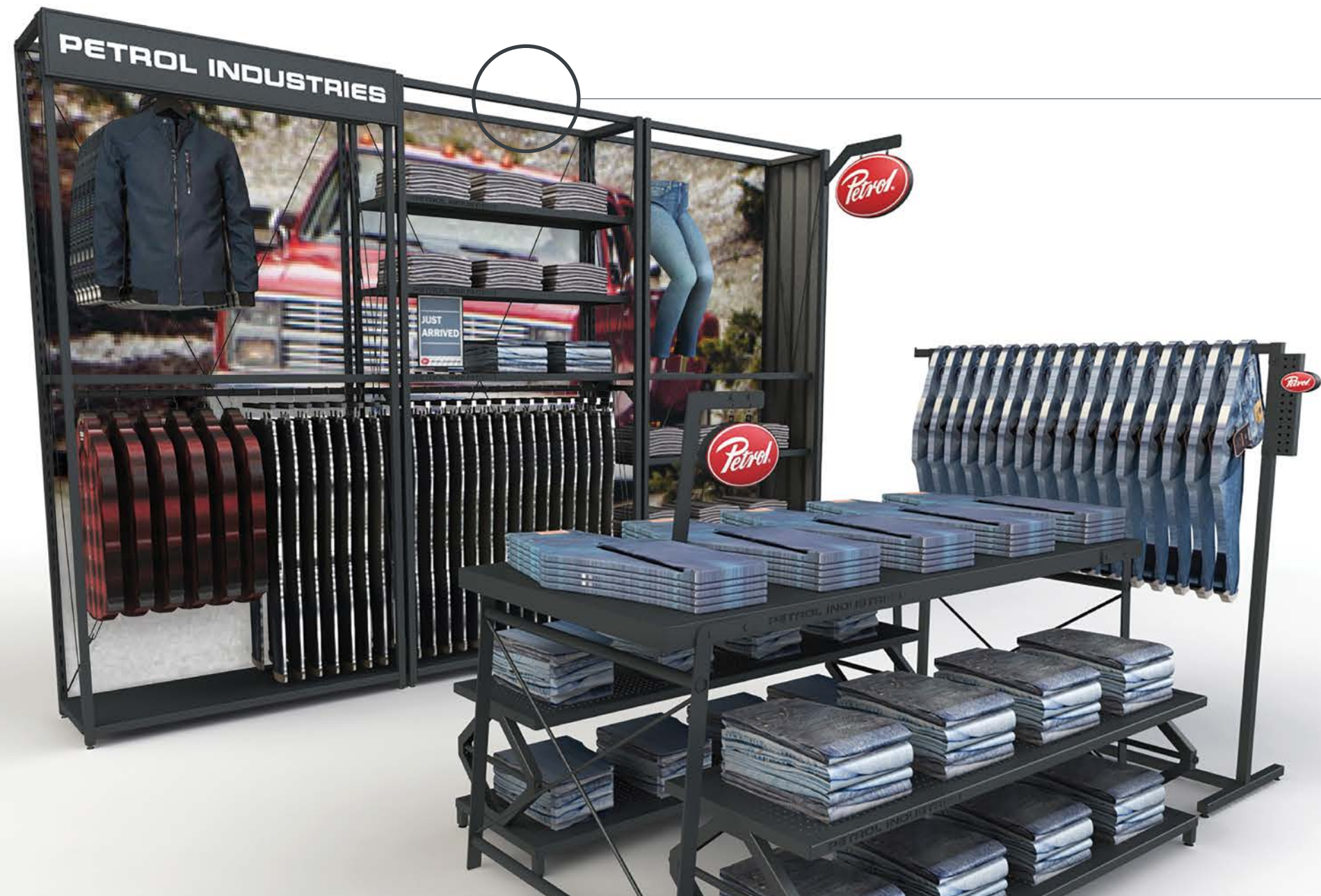
Wall element Shelves + hanging