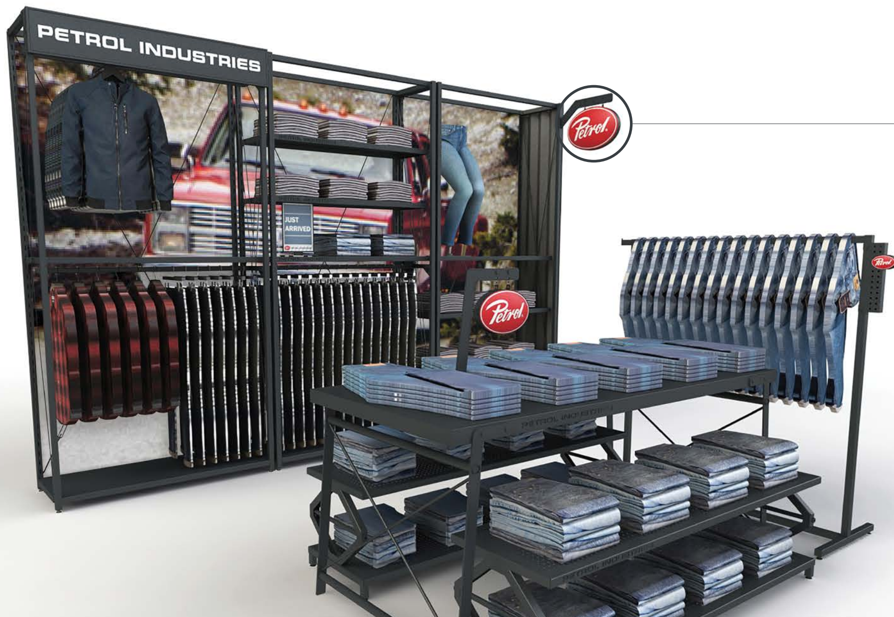
Additional POS material Tin side sign